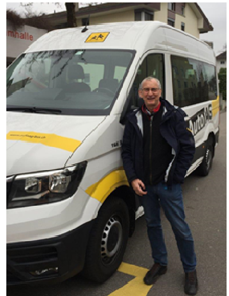
The area: Forch-Küsnacht ZH

Now to the planning for 2025: As in the previous year, I will again be offering the KT1 course (possible from 4 participants, also for groups/clubs by arrangement), the KT2 course and, in collaboration with "moto-trainingskurse.ch", the advanced training course in Interlaken. I am available for driving lessons to all those learner drivers with whom I have already completed initial training in a lower category. Outside of the school vacations, this will only be possible on Saturdays, or Sundays in extreme emergencies. With this letter I would like to call on everyone to contact me with their wishes.